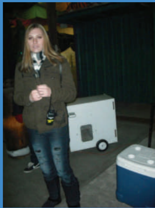
On the set of "Seeking Justice"